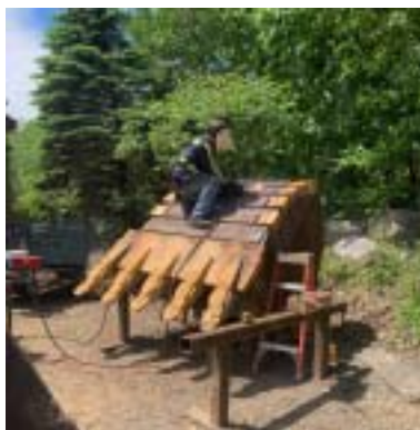
1" Wear Bars being welded to a new 8000 floor, 70" formed x 68" wide in Vermont.