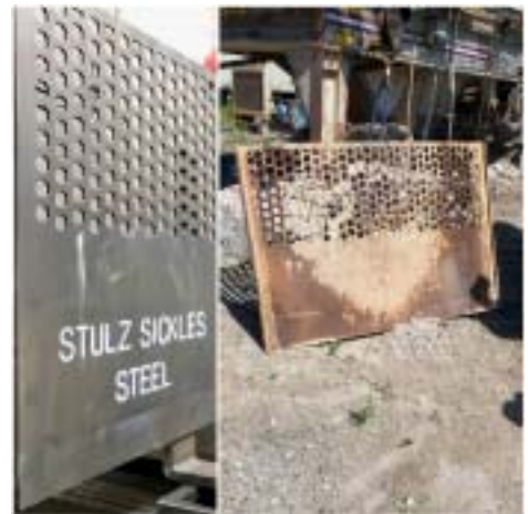
No wear after 600+ hours in two months. Extremely hard stone being processed in Bar Harbor, Maine.