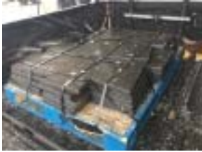
8000 Crusher Liner plates, lasting 2x over OEM