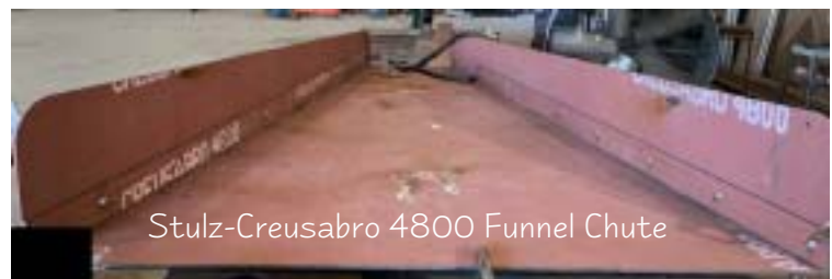
Stulz-Creusabro 4800 Funnel Chute