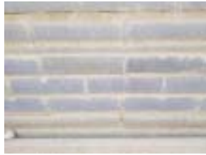
Nevada Gold Mine Shovel. Stulz-Creusabro 8000 outperforming Carbon Overlay