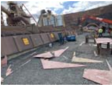
Lining 12 Bins with 4800 at a New Jersey Asphalt Plant