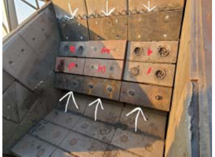
North Virginia asphalt recycling. Top 3 plates: 1" Stulz-Creusabro 8000 with four threaded (tapped) holes each. Bottom 3 plates: 2" Stulz Manganese with two threaded holes each. Middle plates (red marked) are 3" Hardox that wear out every 6-8 months. This was in July 2019. Stulz 8000 and Manganese, still in use (2020).