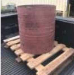
1/4" 4800 formed to Perfect Circle in Illinois