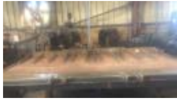
623F Scrapper Floor Northern California