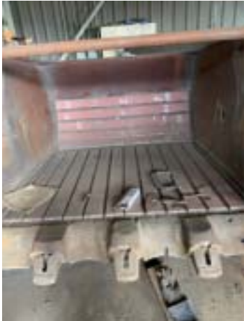
Dragline Bucket lined with 3/4" 8000 bars in Pennsylvania